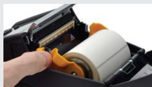
Intuitive peeler operation