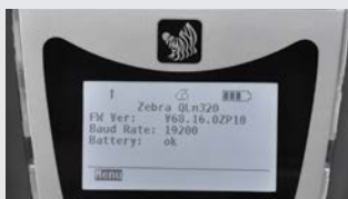
Easy-to-read display with larger, higher-resolution screen